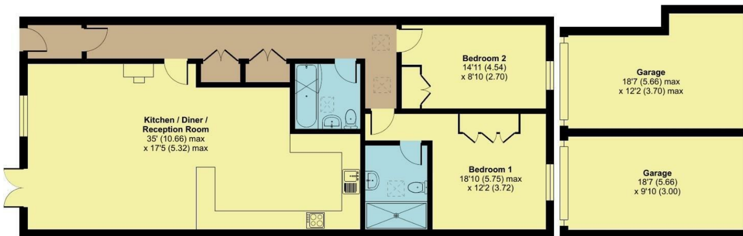
GROUND FLOOR APPROX FLOOR AREA 108.8 SQ M (1172 SQ FT)z